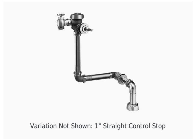
Variation Not Shown: 1" Straight Control Stop